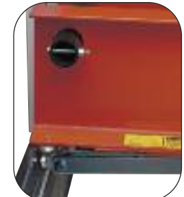
Bearings make bed positioning smooth and easy.