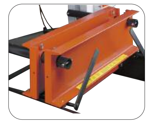
Width adjusts from 4" to over 27"; is secured with locking bolts.